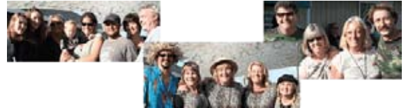
The three 2008 Grand Prize Winning Booths

REGISTER for a 1-in-12 chance, or better, to win GRAND PRIZE: