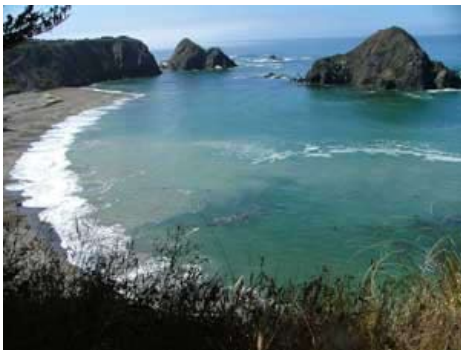
The beach access trail is near the center, offering a spectacular view of Greenwood Beach State Park.

Greenwood Museum and Visitor Center, located on Highway 1, Elk, CA, displays logging artifacts owned by a 5th generation family who are still actively involved, as are other dedicated volunteers.